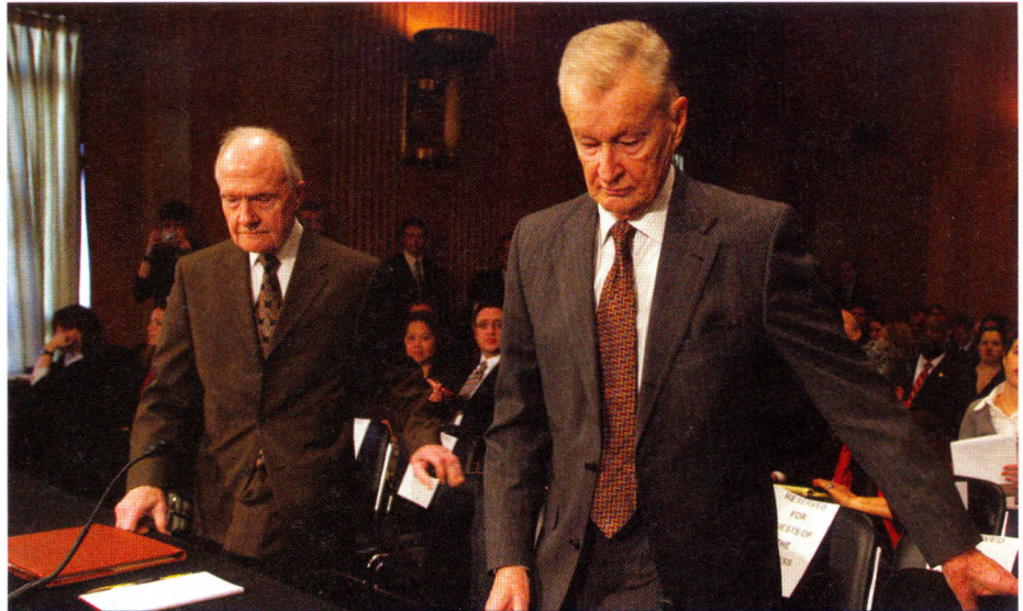
Zbigniew Brzezinski (right) and Brent Scowcroft (left) are both former National Security Advisers, as well as members of the CFR, Trilateral Commission, and Bilderbergers.

Thus the CFR continues to dominate our government’s key areas: finance, defense, foreign policy, and security. To this