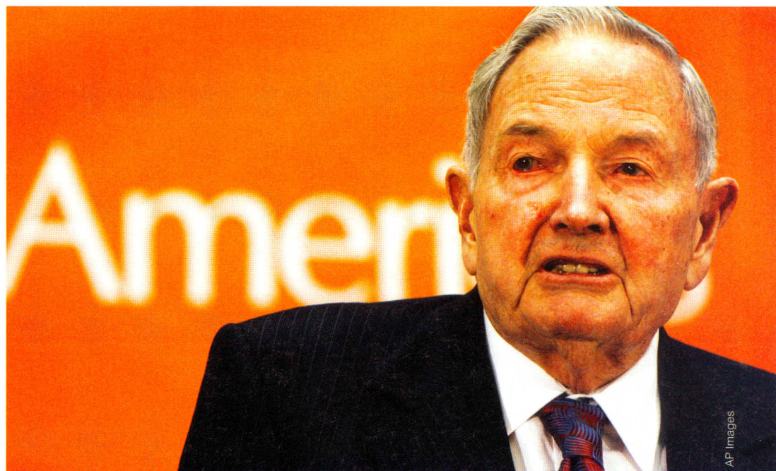
Longtime CFR Chairman David Rockefeller acknowledged in his 2002 book Memoirs that he had worked to establish "one world."

For more than a century ideological extremists at either end of the political spectrum have seized upon