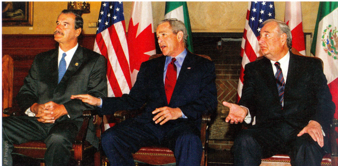
Beginning the SPP: President Bush meets with Mexican President Vicente Fox and Canadian Prime Minister Paul Martin to launch the Security and Prosperity Partnership in March 2005.

the European Union and proposed North American Union are not ends, but only steppingstones to world government. As CFR/Trilateralist Zbigniew Brzezinski stated: "We cannot leap into world government in one quick step. The precondition for genuine globalization is progressive regionalization."