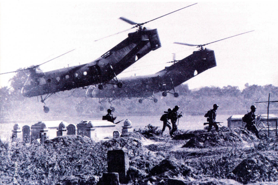
Vietnamese commandos are dropped from American helicopters during a battle with the Viet Cong in 1964. Unprecedented “rules of engagement” prolonged the Vietnam War and precluded victory.

Jimmy Carter was a member of the commission, hand-picked to be president after meeting with Brzezinski and Rockefeller at the latter’s Tarrytown, New York, estate. Carter filled his administration with CFR members and Trilateralists. Indeed, Brzezinski noted in his memoirs that “all the key foreign policy decision makers of the Carter Administration had previously served in the Trilateral Commission.” Carter then embarked on a destructive course of foreign policy that included betraying the Shah of Iran, leading to the installment of Ayatollah Khomeini and the U.S. hostage crisis; betraying President Anastasio Somoza of Nicaragua, resulting in a Marxist dictatorship under the Sandinistas; and betraying Taiwan in order to recognize Communist China — a move previously set up