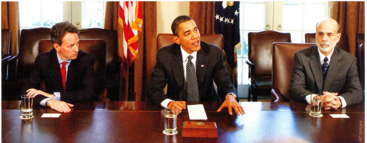
President Obama is flanked by Treasury Secretary Timothy Geithner (CFR, Bilderberger) and Fed Chairman Ben Bernanke (Bilderberger) at a White House economic briefing, March 23, 2009.

12, 2009 issue of the International Herald Tribune entitled “The Chance for a New World Order.” He stated: